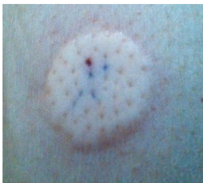
Figure 2. "Quaddle" after intracutaneous injection.

The skin rolling test was performed at the right arm level (all around) before and 15 min after the injections. Pain levels were evaluated using the 0-10 cm VAS.