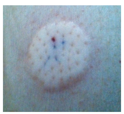
Figure 2. "Quaddle" after intracutaneous injection.

The skin rolling test was performed at the right arm level (all around) before and 15 min after the injections. Pain levels were evaluated using the 0-10 cm VAS.