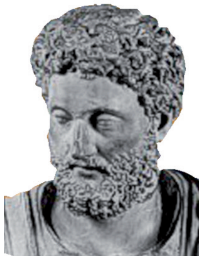
Marcus Aurelius 121 - 180 a.C.