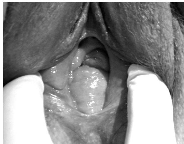
Fig. 1. – Entero/rectocele grade 2-3.

Urodynamic testing (Fig. 3) demonstrated a first desire to void at 220 mls (detrusor pressure 15cm H 2 O) and a second desire to void at 290 mls. Maximal bladder capacity was