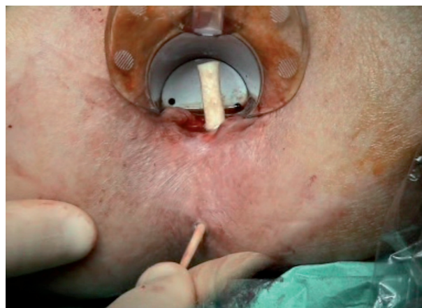
Figure 3. – Fistula plug.

In his commentary, M. Cervigni highlights the importance of the correct timing of a repair and that the decision is simplified by determining of the overall nutritional health of the patient, and the health of the local tissue. A knowledgeable, rational, and current diagnostic approach combined with meticulous surgical technique, could minimize failure and provide relief for the disabling symptoms of these complex patients.