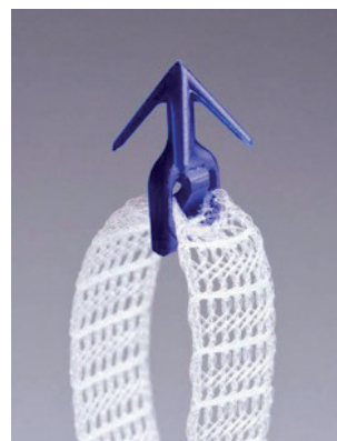
Figure 1. – TFS anchor A 4 pronged polypropylene anchor approximately 11x4mm with a one-way trapdoor at its base sits on a stainless steel applicator. A 7m mm

Create transverse incision (4cm) at versical/cervical junction. Hydrodissect to separate vaginal mucosa from bladder, identify CL; dissect bladder from vaginal mucosa, plicate cystocoele if necessary (2-0 PDS); apply TFS anchor at insertion of CL to ATFP sited approximately 2cms superior and 1cm lateral to the ischial spine. Close tunnel and incision in layers.